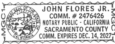
Place Notary Seal Above

Signature [Handwritten Signature] Signature of Notary Public