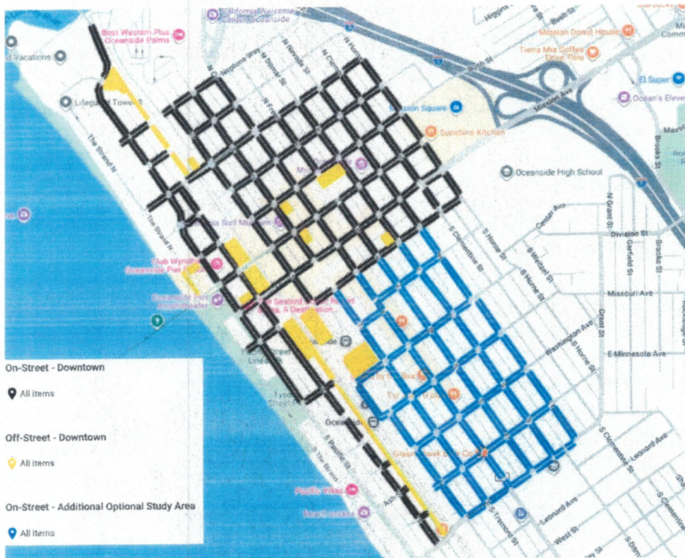
Figure 2. Study Area