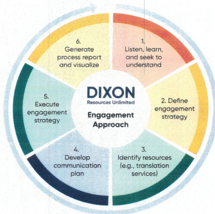
Figure 1. DIXON's Engagement Approach

Our engagement will include three separate in-person engagement events, including a stakeholder survey, and options for additional virtual meetings or in-person pop-up events as required. We offer a great variety of engagement activities, which can be tailored to support different stakeholder groups and accommodate community events and seasonal demands: