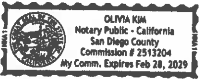
Place Notary Seal and/or Stamp Above

I certify under PENALTY OF PERJURY under the laws of the State of California that the foregoing paragraph is true and correct. WITNESS my hand and official seal.